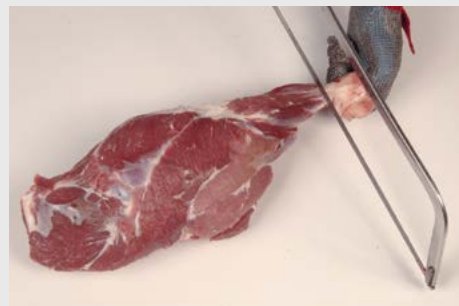
6. Remove the end of the knuckle bone.