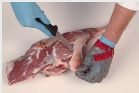
5. and fat.