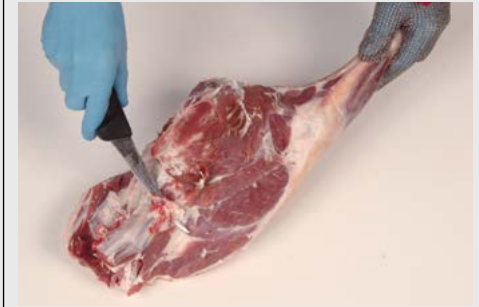
4. excess blood particles