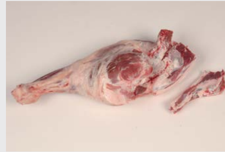
3. Remove the vertebrae and tail bone,