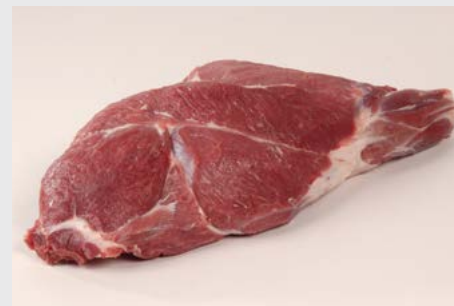
7. Fully trimmed and prepared leg.