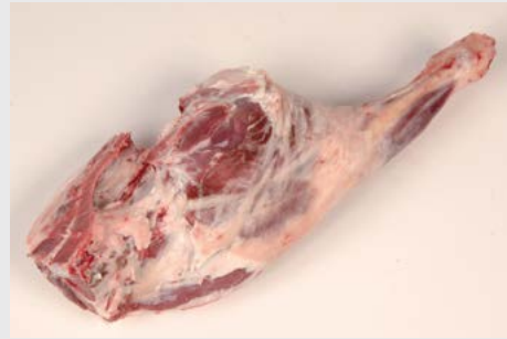
2. Leg of Lamb.